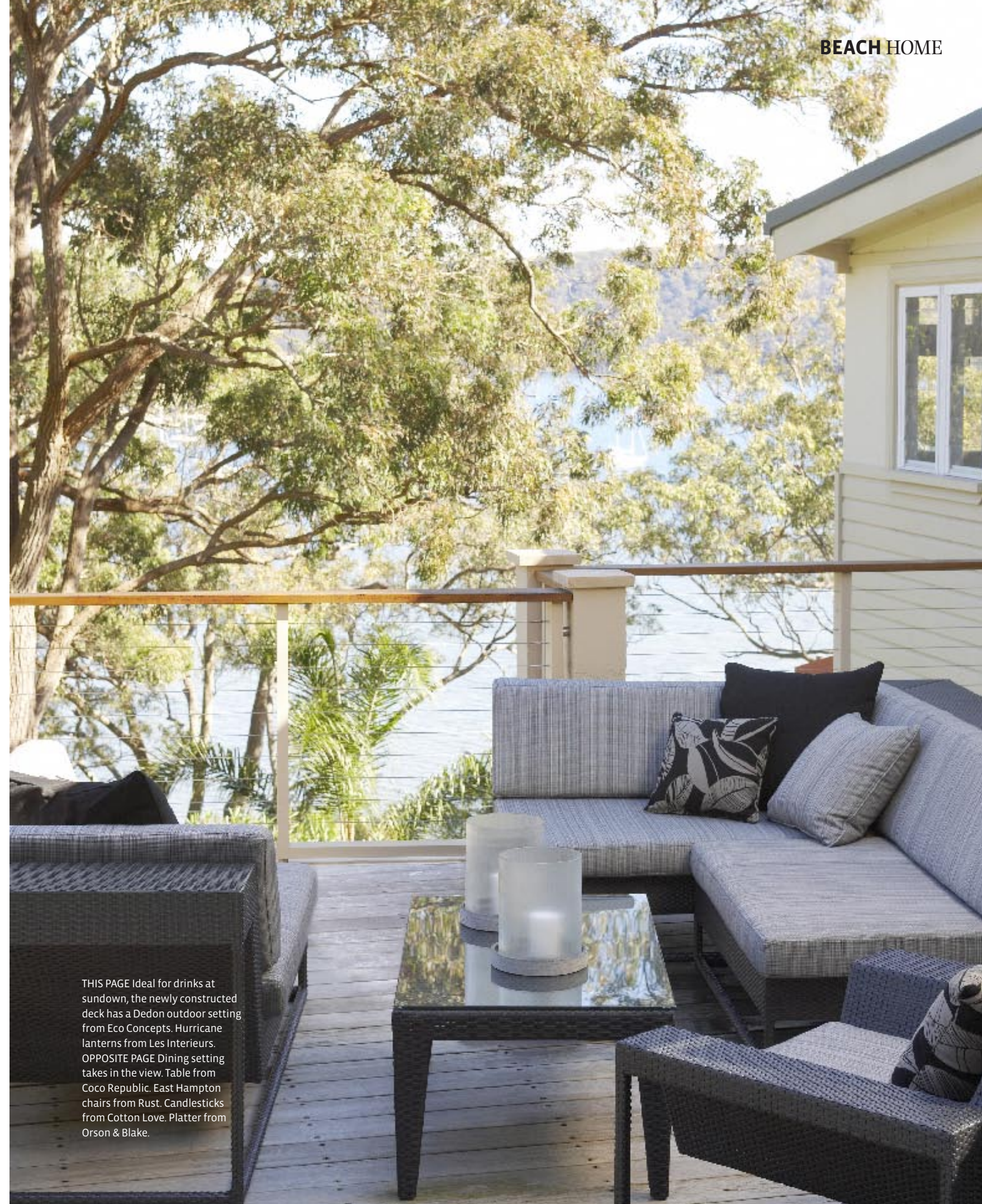
THIS PAGE Ideal for drinks at sundown, the newly constructed deck has a Dedon outdoor setting from Eco Concepts. Hurricane lanterns from Les Interieurs. OPPOSITE PAGE Dining setting takes in the view. Table from Coco Republic. East Hampton chairs from Rust. Candlesticks from Cotton Love. Platter from Orson & Blake.